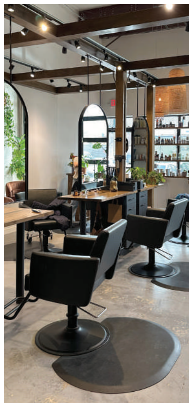
Ladybird Society | Austin, TX