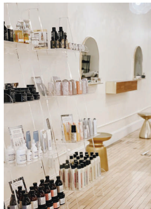
Hi Honey Salon | Bismarck, ND