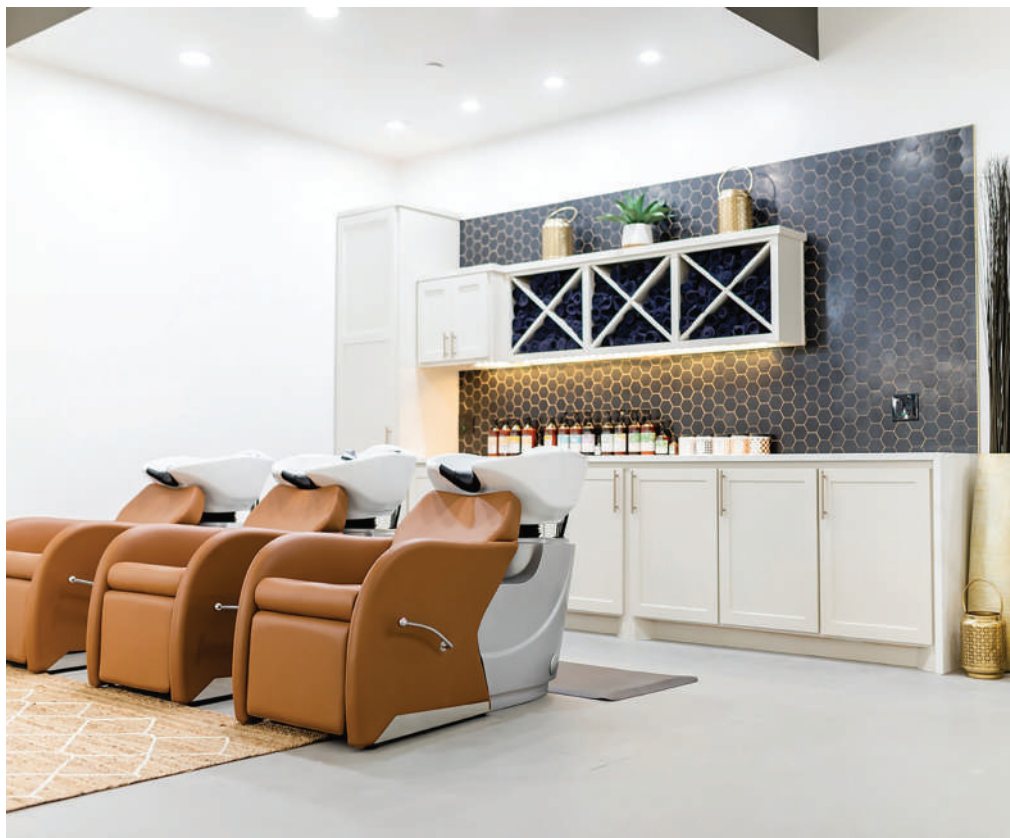
Bonjour Belle | Austin, TX