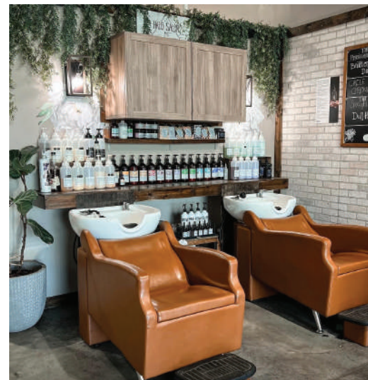
HaloSalon KC | Lees Summit, MO