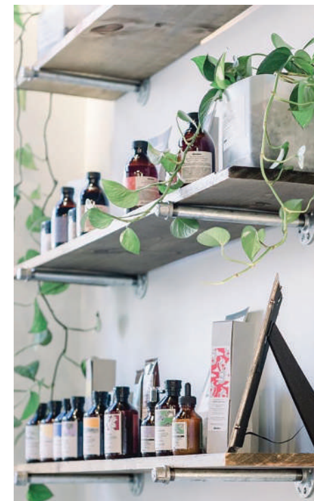
Blowout | Morristown, NJ