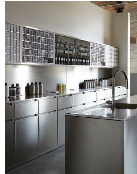
The Color Bar at the Davines Group House | Brooklyn, NY