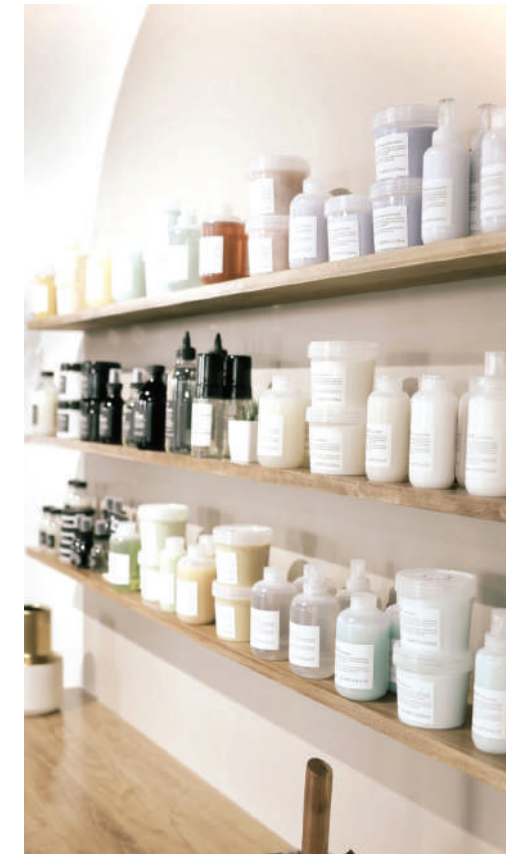
Her Beauty | Marion, IA