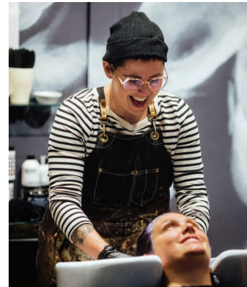
ananda hair studio | Asheville, NC

****Due to timing, Education Vouchers are not applicable to Berlin WWHT 2024.