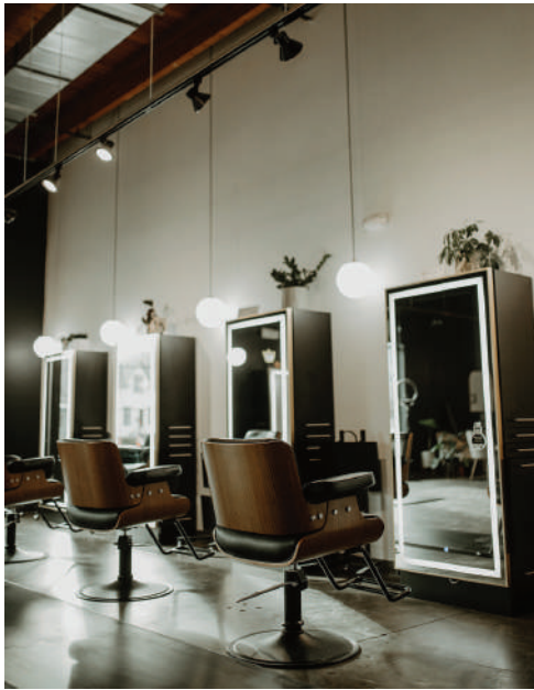
Crown Salon | Missoula, MT