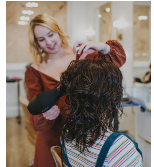
Modern Muse Beauty Collective | Austin, TX