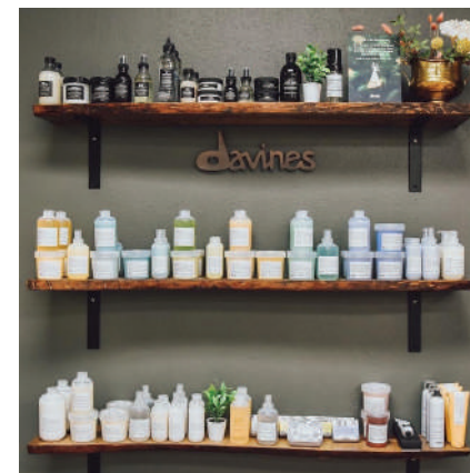
Salon D'Elle | Sturgeon Bay, WI