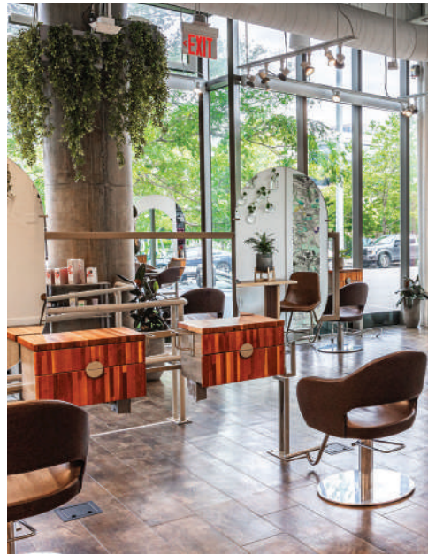
Love & Mercy Salon | Boston, MA

For education, you will receive a flat discount based on the total amount you spend on Davines products.