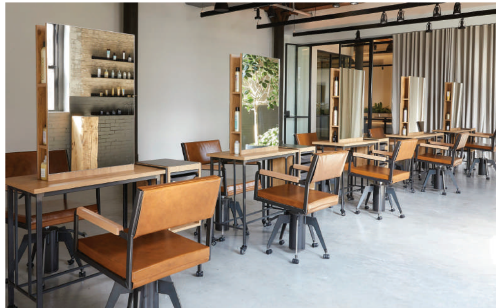
The Studio at the Davines Group House | Brooklyn, NY