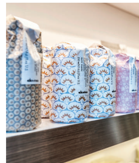
Kiss Kiss Bang Bang Salon | Fishers and Carmel, IN